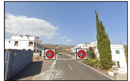
META KM 4,400